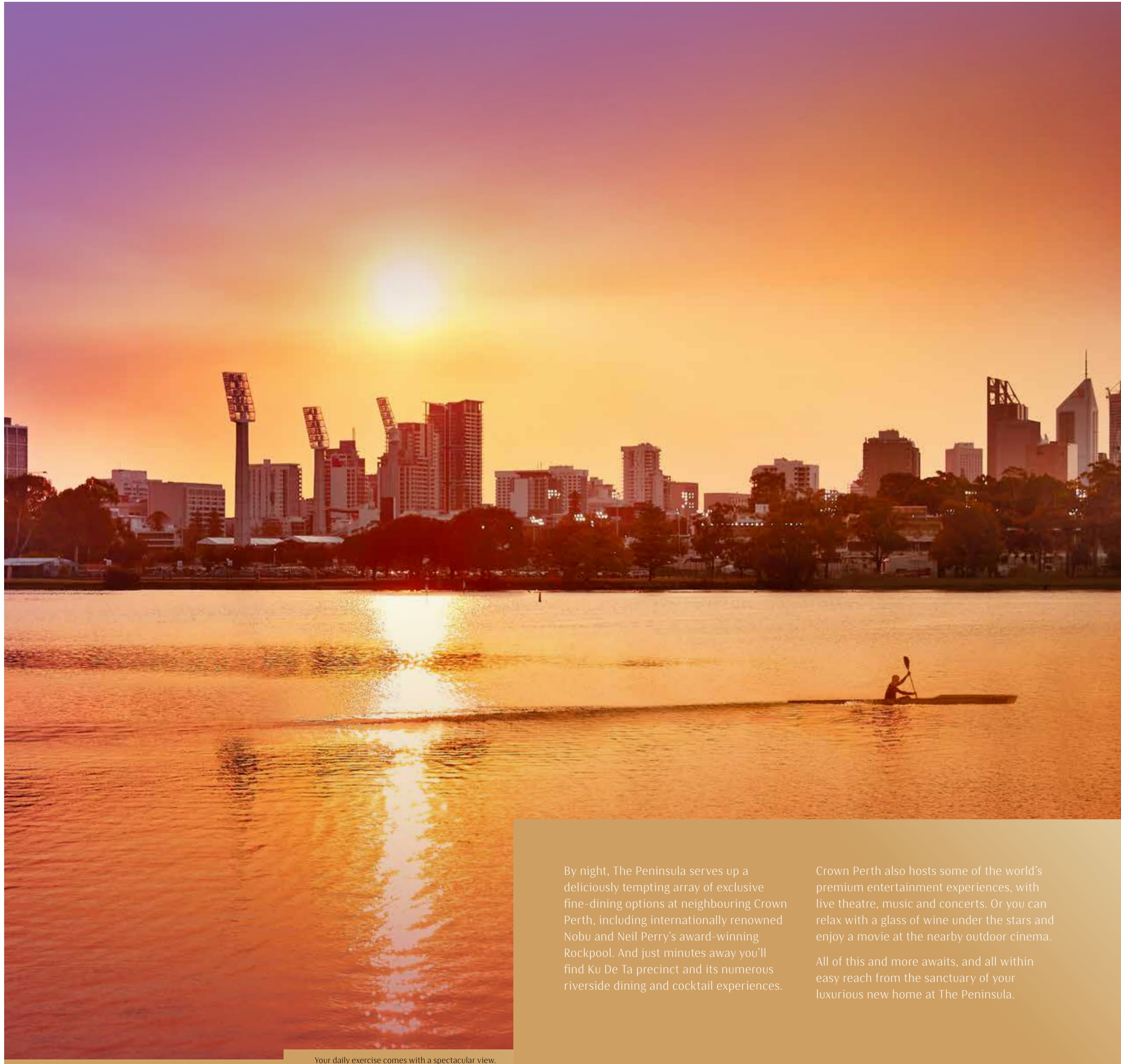
Your daily exercise comes with a spectacular view.

By night, The Peninsula serves up a deliciously tempting array of exclusive fine-dining options at neighbouring Crown Perth, including internationally renowned Nobu and Neil Perry's award-winning Rockpool. And just minutes away you'll find Ku De Ta precinct and its numerous riverside dining and cocktail experiences. Crown Perth also hosts some of the world's premium entertainment experiences, with live theatre, music and concerts. Or you can relax with a glass of wine under the stars and enjoy a movie at the nearby outdoor cinema. All of this and more awaits, and all within easy reach from the sanctuary of your luxurious new home at The Peninsula.