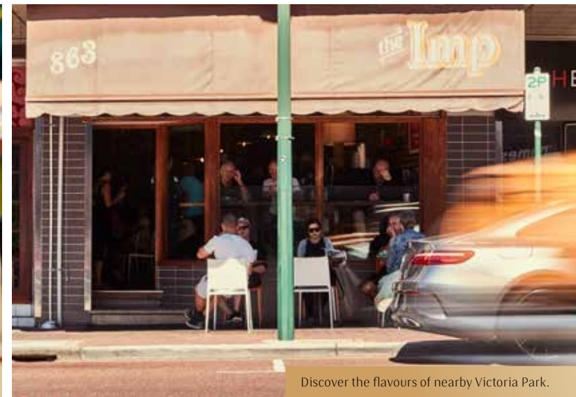
Discover the flavours of nearby Victoria Park.