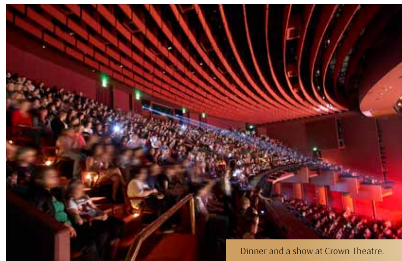
Dinner and a show at Crown Theatre.