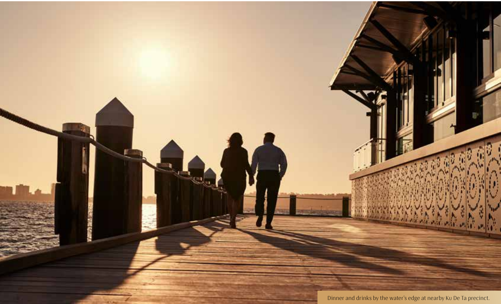
Dinner and drinks by the water's edge at nearby Ku De Ta precinct.