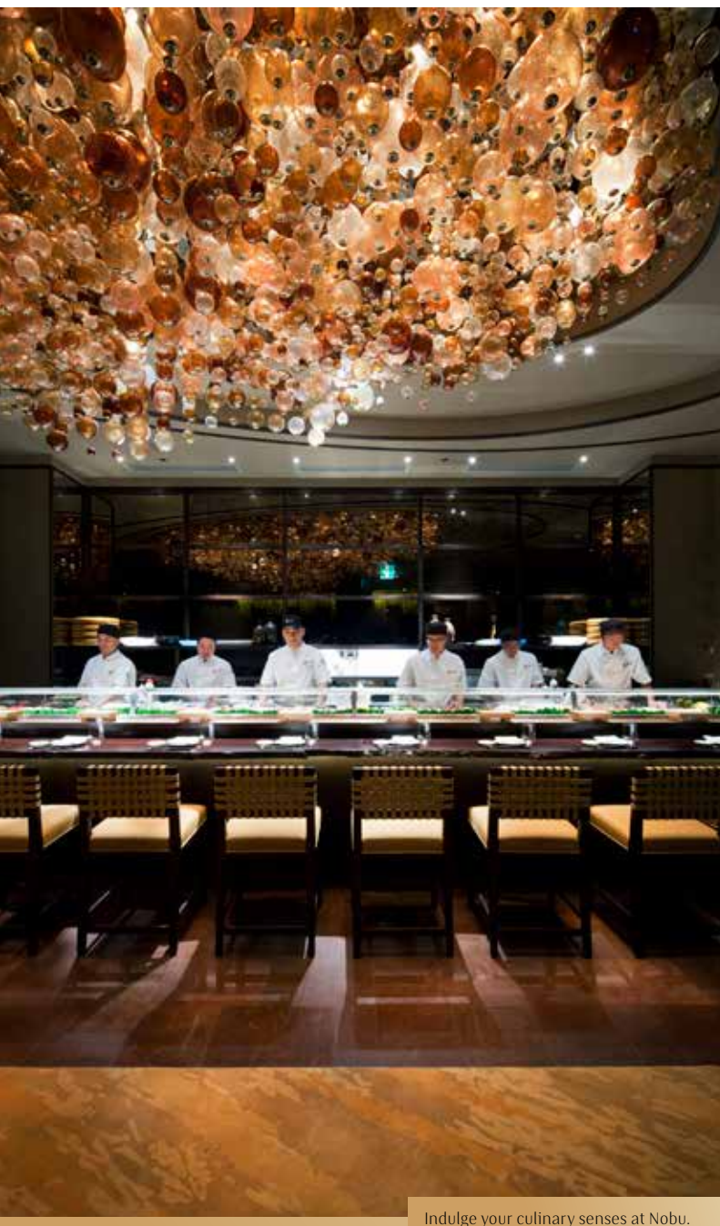
Indulge your culinary senses at Nobu.