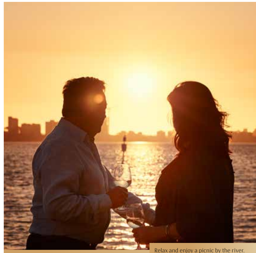
Relax and enjoy a picnic by the river.