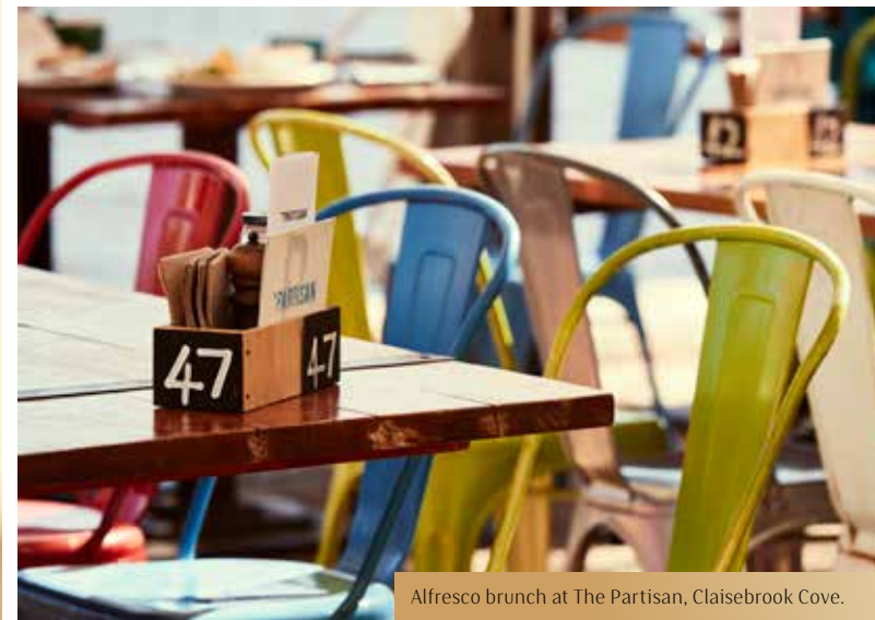
Alfresco brunch at The Partisan, Claisebrook Cove.